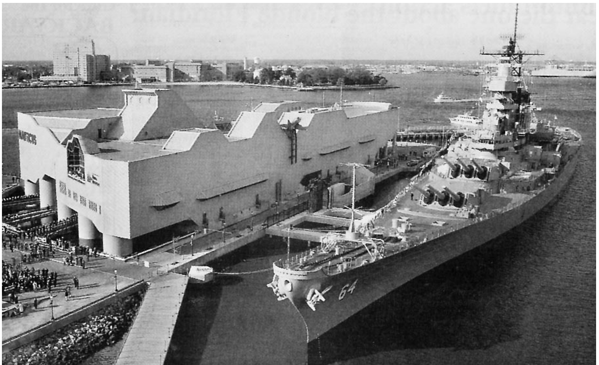
The USS Wisconsin at the National Maritime Center in Norfolk, VA.

The Wisconsin Veterans Museum, 30 West Mifflin Street, in Madison, has a display about the ship, including the ship's bell.