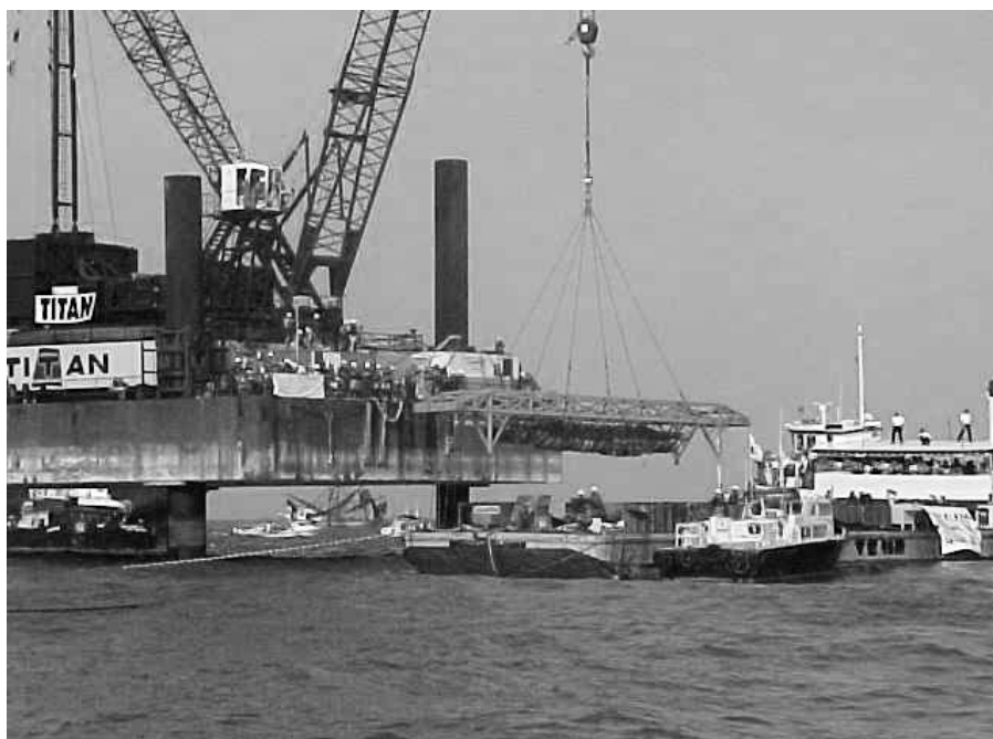
Lifting the CSS Hunley.

The Hunley sank twice before that infamous February night. Raised and refitted for service both of those times, the Hunley Project carried on the tradition with their recovery of the sub this past summer. In this refitting, however, she is charged with educating future generations about her history and, according to the Hunley Commission, also to, "convey the attributes she symbolizes, including valor, courage, sacrifice, commitment and integrity". The Hunley recovery was an ambitious task, financially and logistically. However, with widespread continued interest in the Civil War and with a best-selling author behind the project, the public embraced the excavation, generating unprecedented interest in underwater archeology. For more information check out the project web site at www.hunley.org .