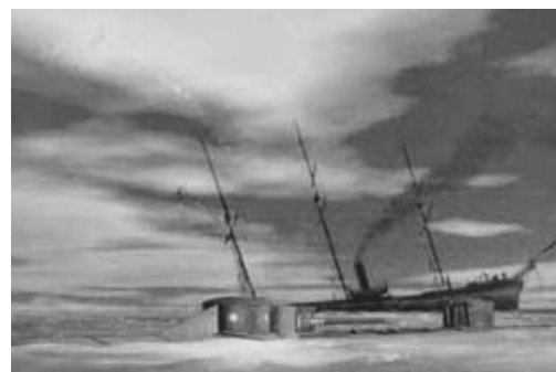
Computer generated graphic of the USS Housatanic. by Dan Dowdy.

But what is inside this 1864 time capsule? The bodies of the nine-man