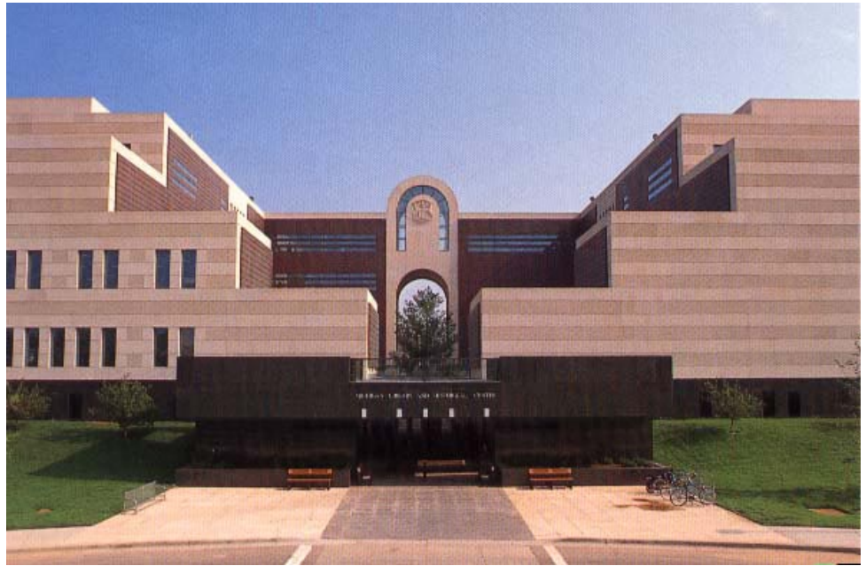
The Michigan Library and Historical Center, home to the Michigan Historical Museum, an AGLMH institutional member, was the site of the mid-year board of directors meeting.

Financial relief for our Canadian members was one issue addressed during the annual mid-year business meeting of the Association for Great Lakes Maritime History which was held on March 13, 1999 at the Michigan Library & Historical Center in Lansing.